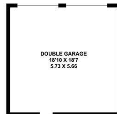
GARAGE APPROX. FLOOR AREA 349 SQ.FT. (32.43 SQ.M.)

TOTAL APPROX. FLOOR AREA 1919 SQ.FT. (178.25 SQ.M.)